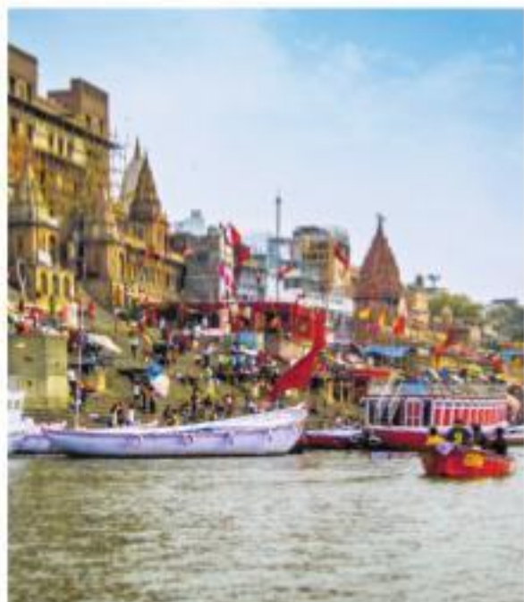
Airbnb's presence was the highest in Goa, where its guests' spending amounted to almost USD 190 million

NEW research from Oxford Economics found Airbnb is an important pillar of India's tourism industry, contributing over USD 920 million (₹72 billion) to Gross Domestic Product and supporting over 85,000 Indian jobs in 2022 alone.