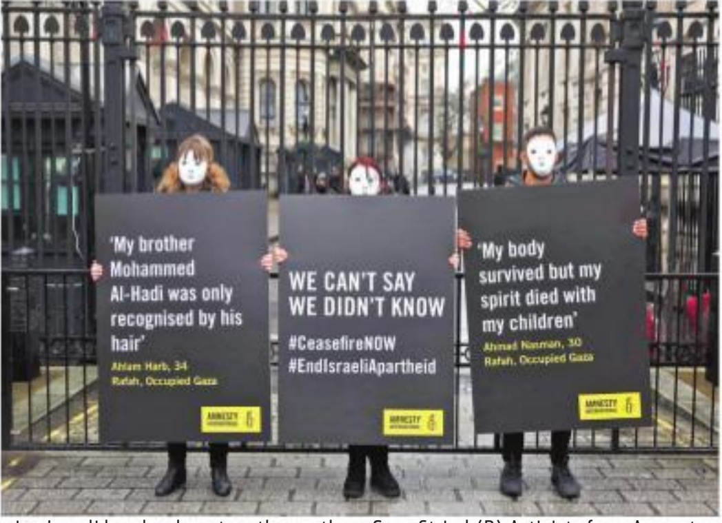
A picture taken from Rafah shows smoke billowing over Khan Yunis in the distance following Israeli bombardment on the southern Gaza Strip | (R) Activists from Amnesty International hold placards with statements made by civilians living in Rafah during a silent vigil outside the gates of Downing Steet in central London | PICS: AFP