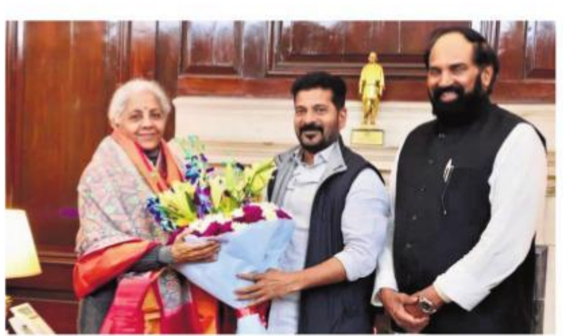
TS CM Revanth called on Finance Minister Nirmala Sitharaman in Delhi I express

revamp the TSPSC after a series of question paper leak cases and the cancellation of examinations during the BRS government. Revanth told Manoj Soni that the Telangana government would study the UPSC pattern and implement it in the state.